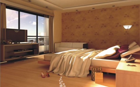
Real Room Size: