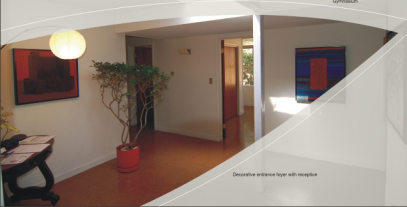
Decorative entrance foyer with reception